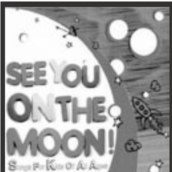
Various Artists See You on the Moon! (Songs for Kids of All Ages) (Universal Music Can)