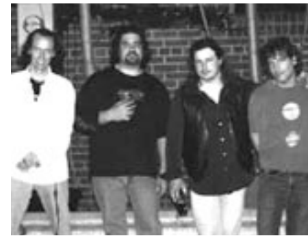
Group name: The Wynne Band When/where playing this week? Friday, June 9 @ McGarett's, 946 Elmwood Avenue, Buffalo. Show starts 9:30pm.